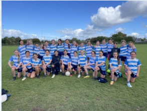
The Girls Football Team